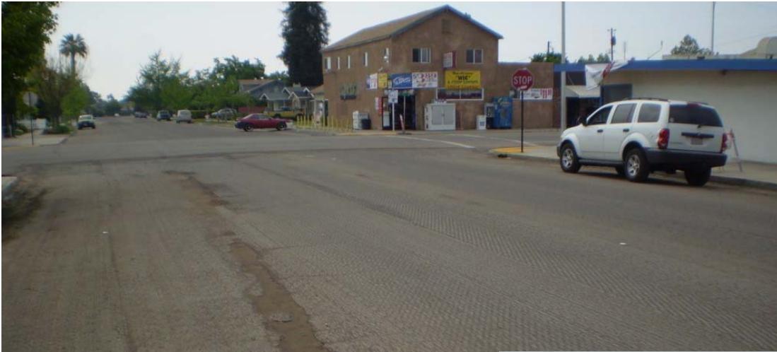
Cape over the dirt strip on 11th and C st.