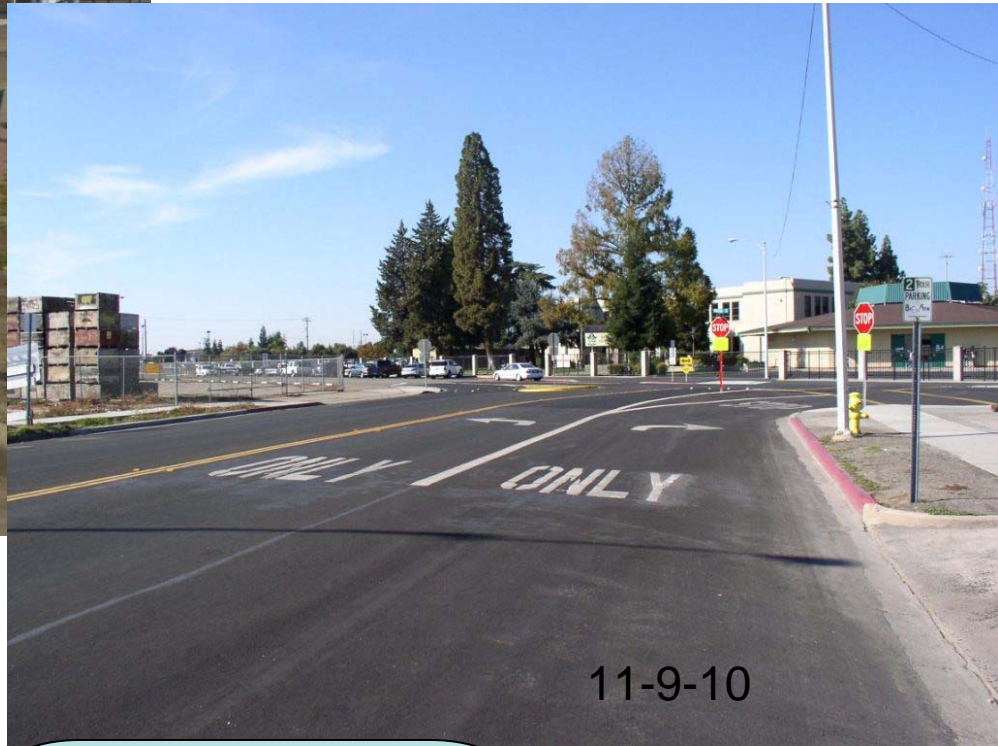
Pavement condition after 76-22TR chip seal with slurry